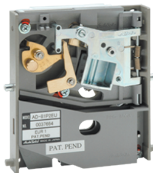
MODEL AD-81P2 EU

UTILIZING A CRADLE AND MAGNET TO ENSURE STRICT INSPECTION OF EACH COIN, THIS 3.5" WIDE COMPACT SELECTOR IS USED EXTENSIVELY IN THE AMUSEMENT INDUSTRY.